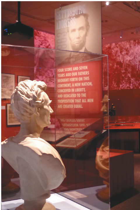
Gettysburg Address and Lincoln Bust