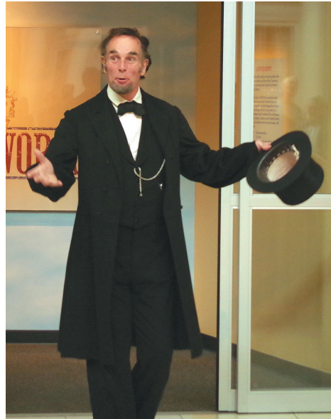
Lincoln Welcomes Visitors

The exhibit opens with the 1858 speech "A House Divided Against