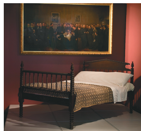
Bed where Lincoln died.