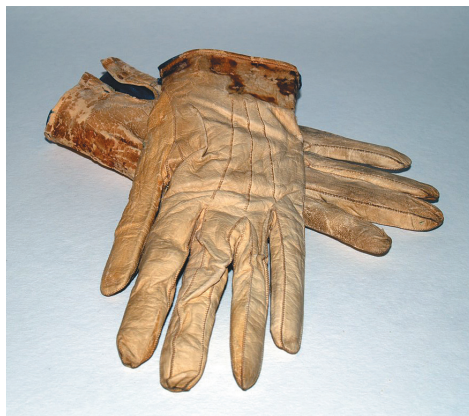
Bloody gloves Lincoln carried when he was shot.