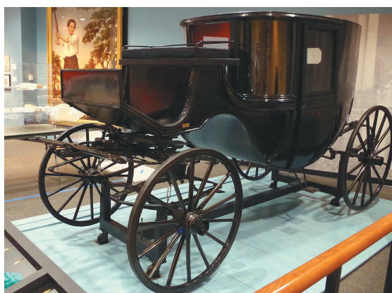
Carriage used by President Lincoln and his wife, Mary Todd Lincoln.